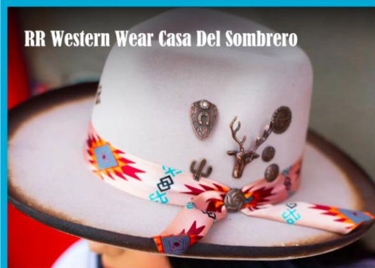
RR Western Wear Casa Del Sombrero