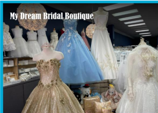
My Dream Bridal Boutique