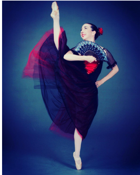
Please contact business for more information.