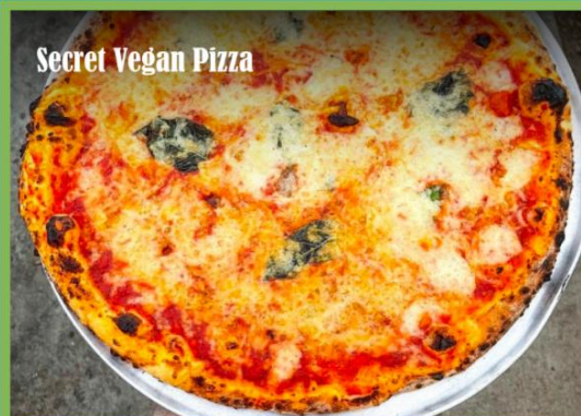
Secret Vegan Pizza